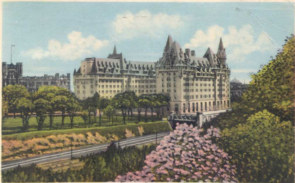
Chateau Laurier, Canadian National Railways Hotel, Ottawa, Ontario, Canada.—98