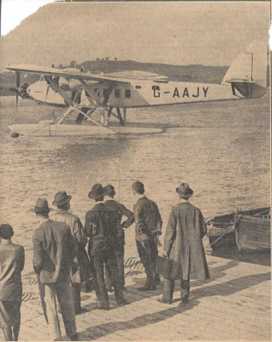
SEAPLANE TEST.—Claimed to be the biggest seaplane, the Valetta, constructed by Messrs. Short Bros., was tested at Rochester yesterday. It has three Bristol Jupiter XI F engines and has a cruising speed of 120 miles an hour.